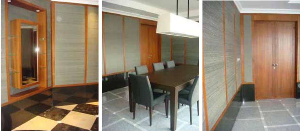
Existing condition of the interior walls and the meeting room.