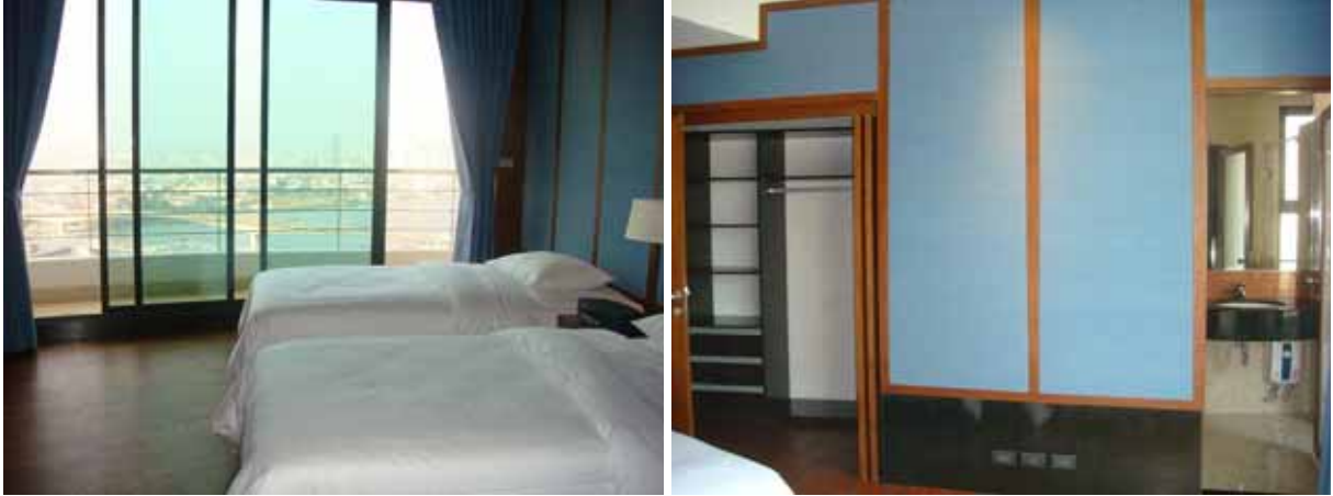
Existing condition of the upstairs bedroom, walk-in closet and bathroom entrance.