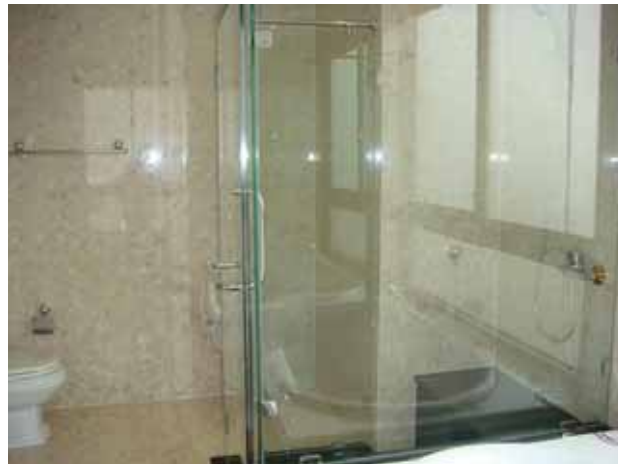
Existing condition of the bathroom of the downstairs bedroom.