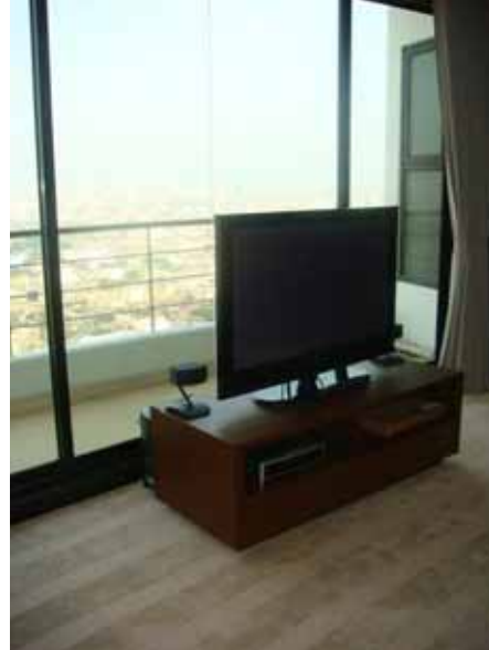
Existing condition of the downstairs bedroom.