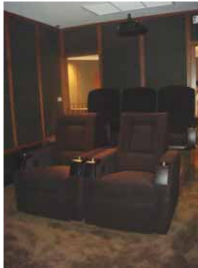
Existing condition of the theater room.