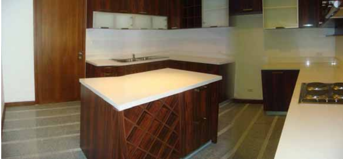
Existing condition of the kitchen.