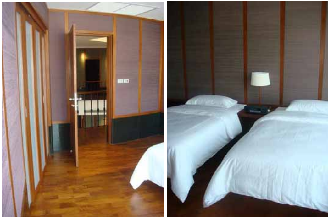
Existing condition of the second upstairs bedroom.