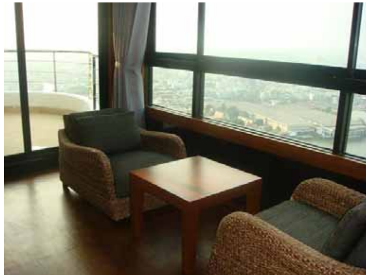
Existing condition of the master bedroom.