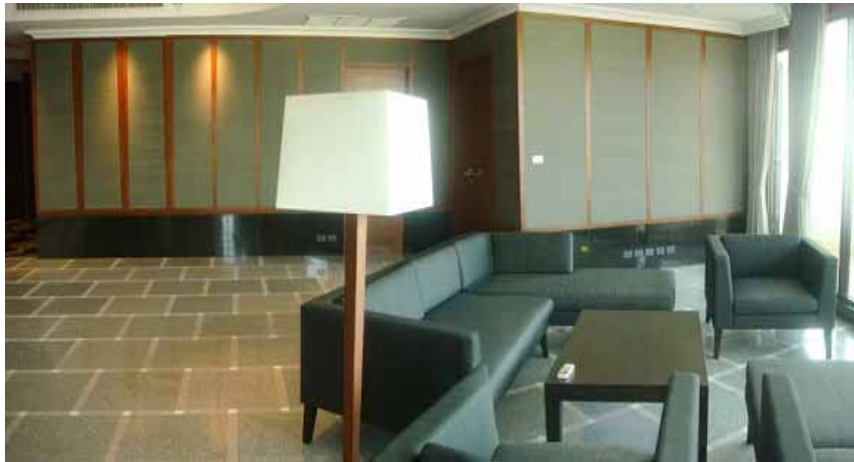
Existing conditions of the living room.